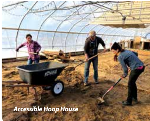
Accessible Hoop House