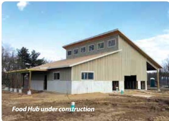
Food Hub under construction