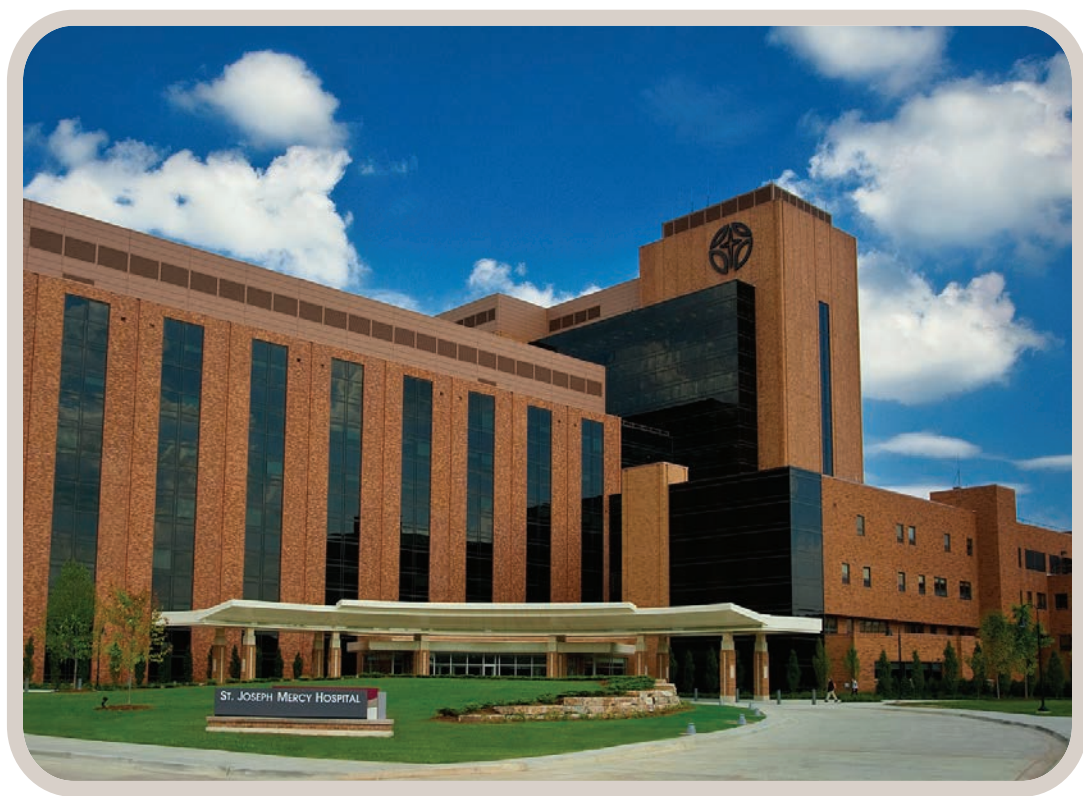
The new entrance at St. Joseph Mercy Ann Arbor

The Renewal Campaign has supported the construction of not only the Hospital's new North Tower (2010) and East Tower (2007), but also paid in part for the new Chapel (2010), the Helen and Marion S. DeWeese Surgery Pavilion (2008), the Family Birth and Imaging Center (2004) and the renovated Emergency Department (2003). For more information about supporting the Renewal Campaign, please call the SJMHS Office of Development at 734-712-4040.